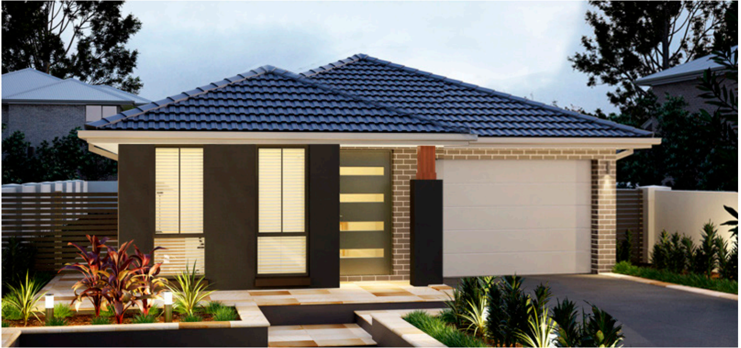
ARTIST IMPRESSION ONLY. CAPRI BRICK FAÇADE AS ILLUSTRATED.