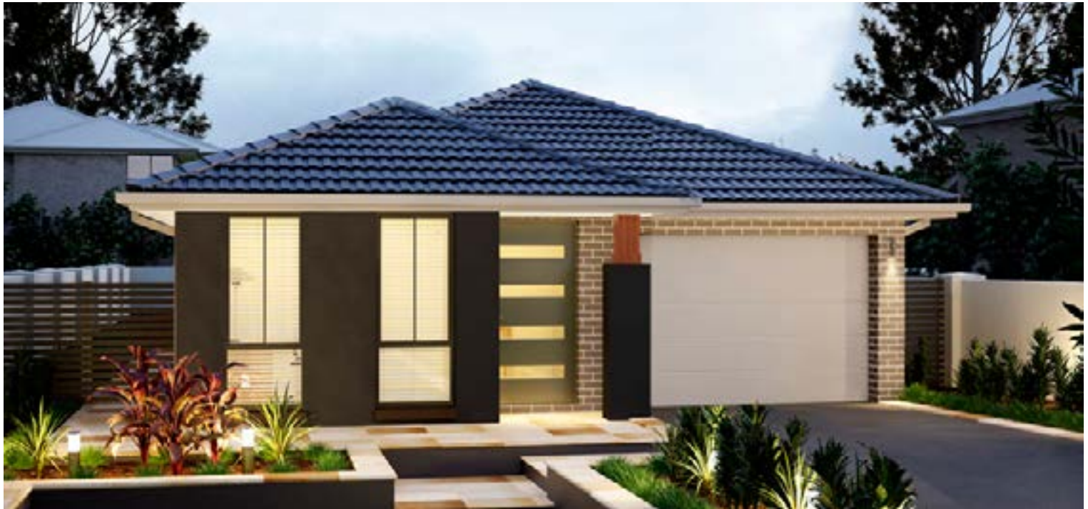
ARTIST IMPRESSION ONLY. CAPRI FAÇADE AS ILLUSTRATED. BDY: 10.0