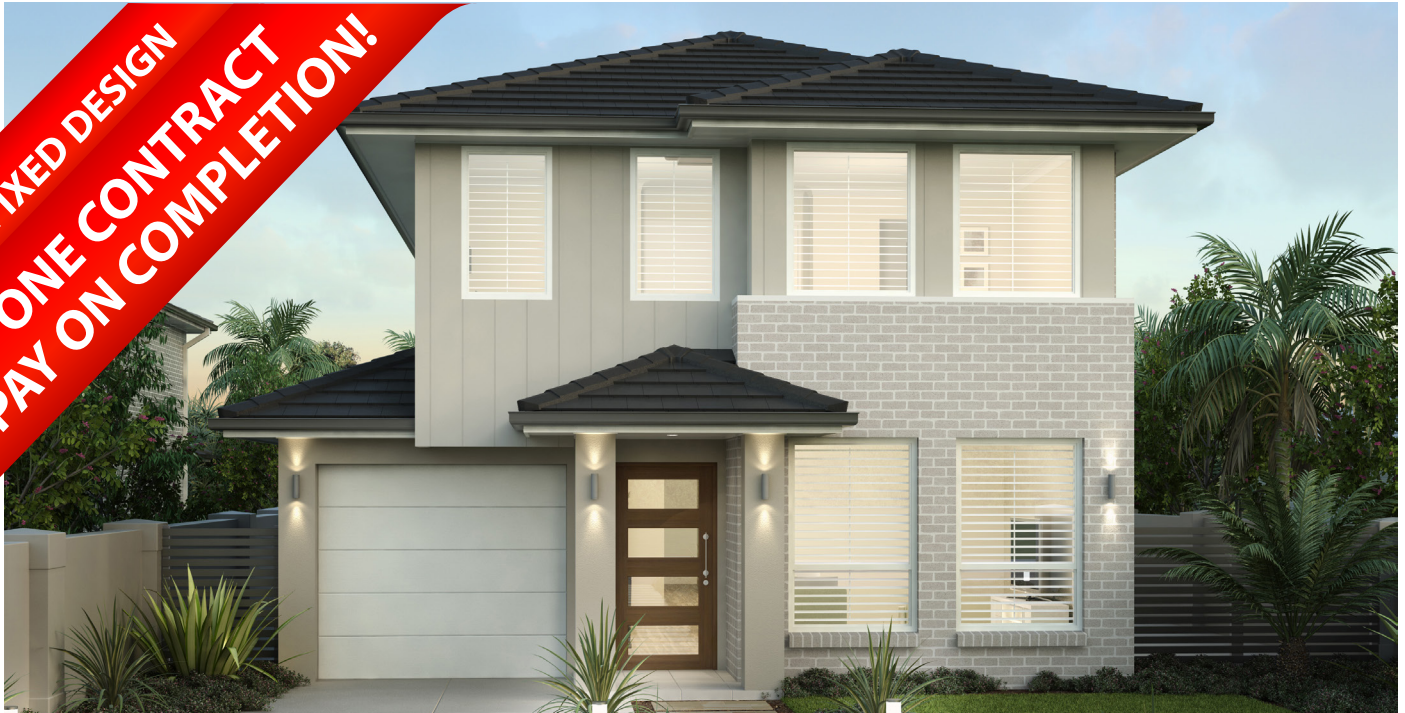
ARTIST IMPRESSION ONLY. WINSTON FACADE AS ILLUSTRATED.

FIXED DESIGN ONE CONTRACT PAY ON COMPLETION!