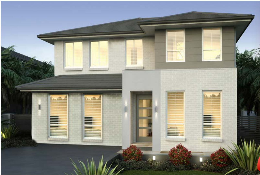
ARTIST IMPRESSION ONLY. TRADITIONAL MKIV FAÇADE AS ILLUSTRATED.