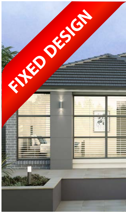
ARTIST IMPRESSION ONLY. BROOKLYN FAÇADE AS ILLUSTRATED.