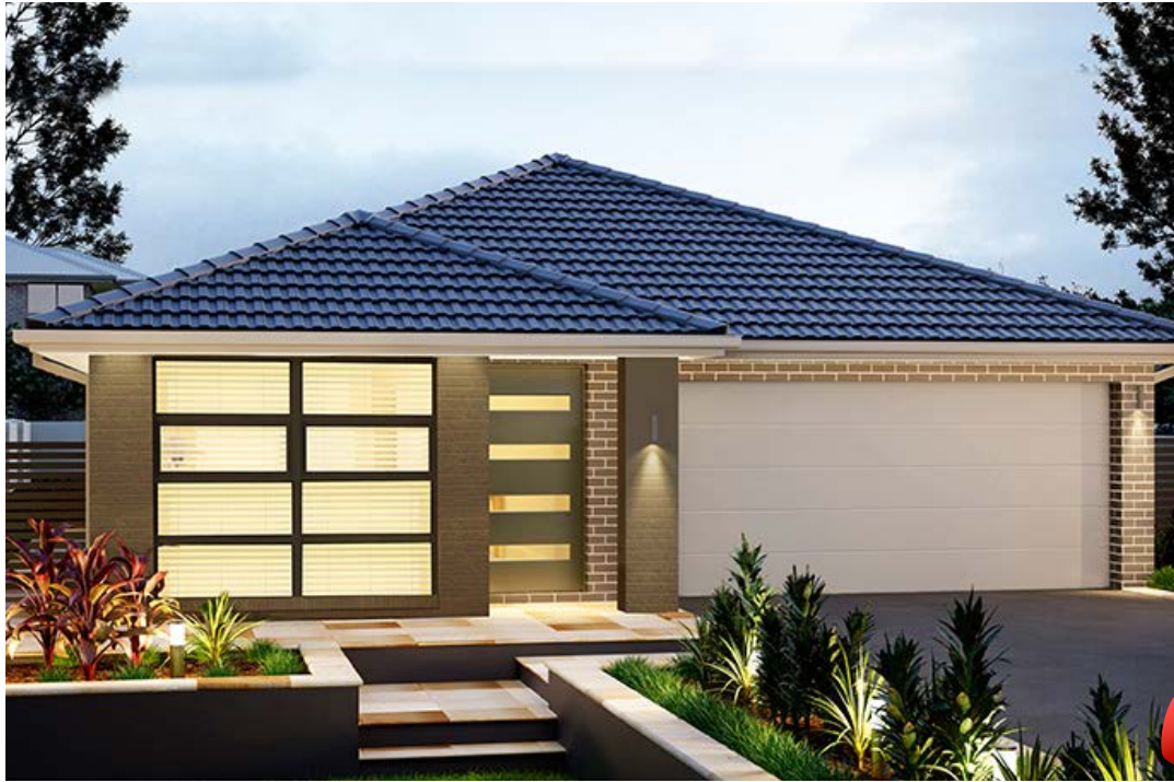
ARTIST IMPRESSION ONLY. DUNE FAÇADE AS ILLUSTRATED.