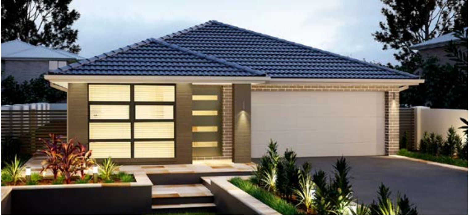
ARTIST IMPRESSION ONLY. DUNE FAÇADE AS ILLUSTRATED.