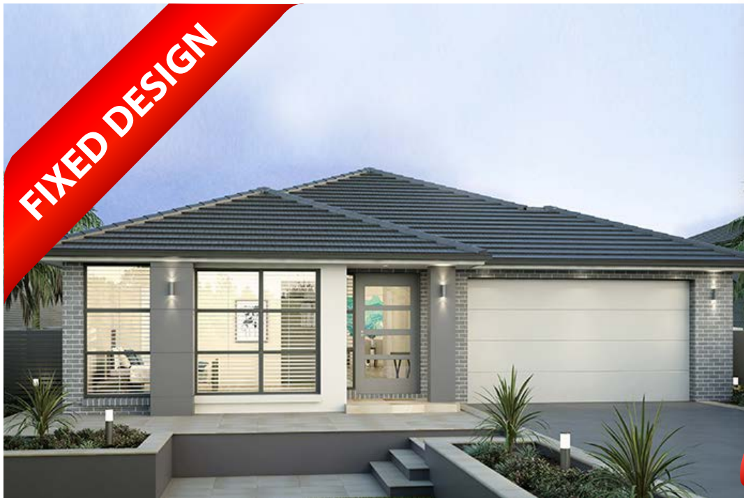
ARTIST IMPRESSION ONLY. BROOKLYN FAÇADE AS ILLUSTRATED.