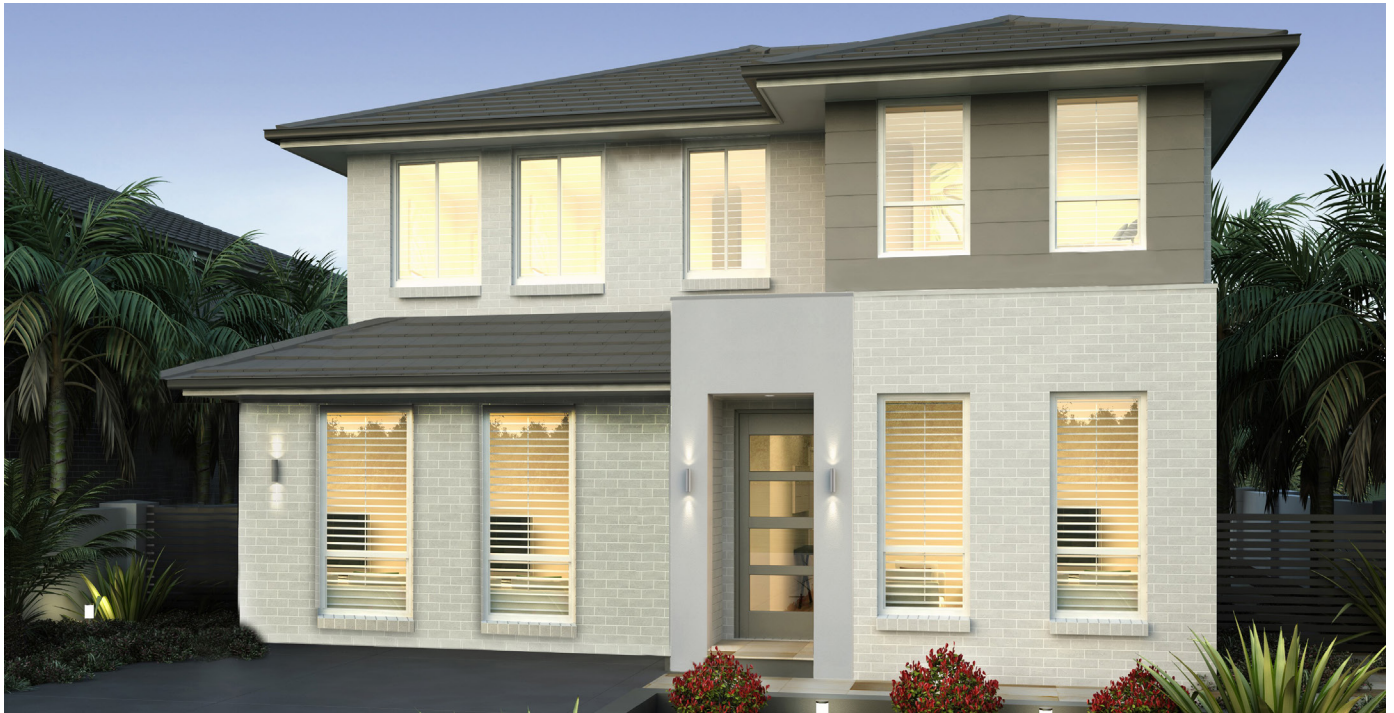
ARTIST IMPRESSION ONLY. TRADITIONAL MKIV FAÇADE AS ILLUSTRATED.