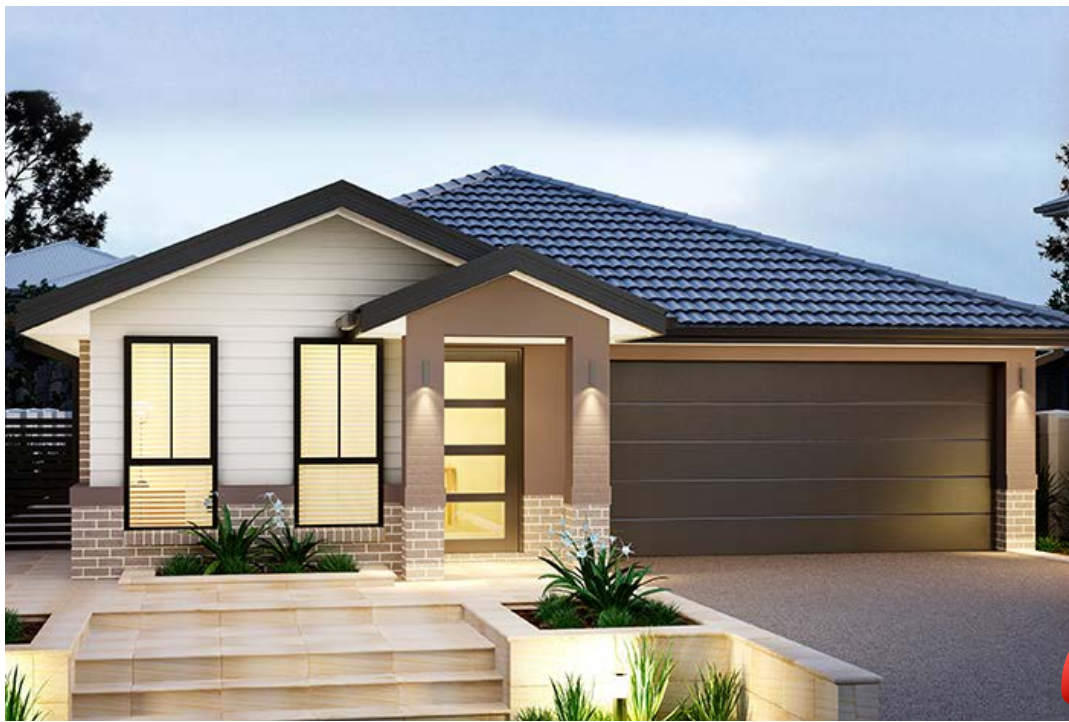
ARTIST IMPRESSION ONLY. TRADITIONAL FACADE AS ILLUSTRATED.