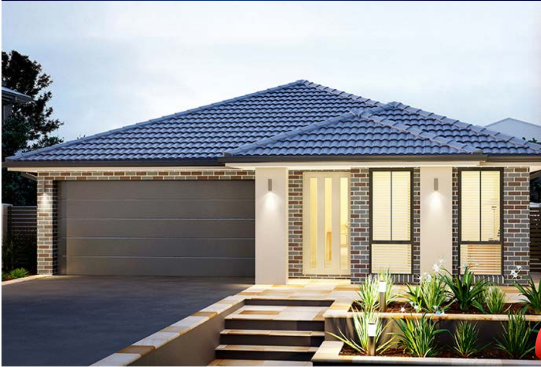
ARTIST IMPRESSION ONLY. ASPEN FAÇADE AS ILLUSTRATED.