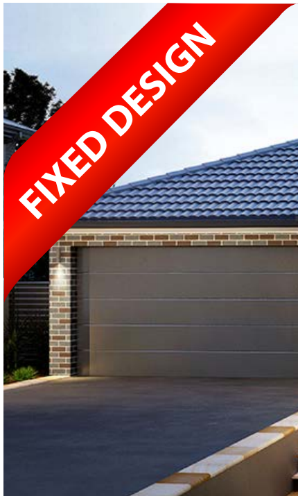
ARTIST IMPRESSION ONLY. ASPEN MOD FAÇADE AS ILLUSTRATED.