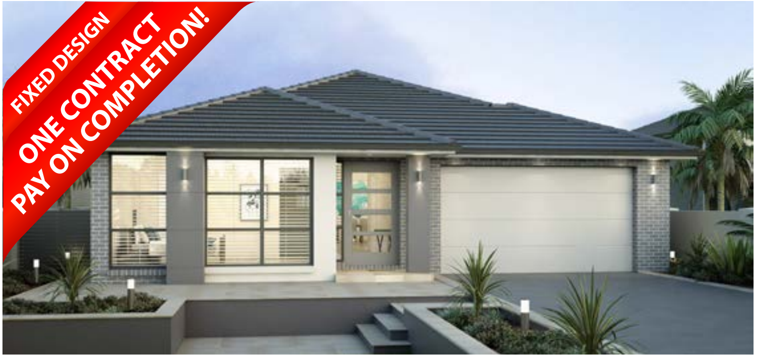
ARTIST IMPRESSION ONLY. BROOKLYN FAÇADE AS ILLUSTRATED.

FIXED DESIGN ONE CONTRACT PAY ON COMPLETION!