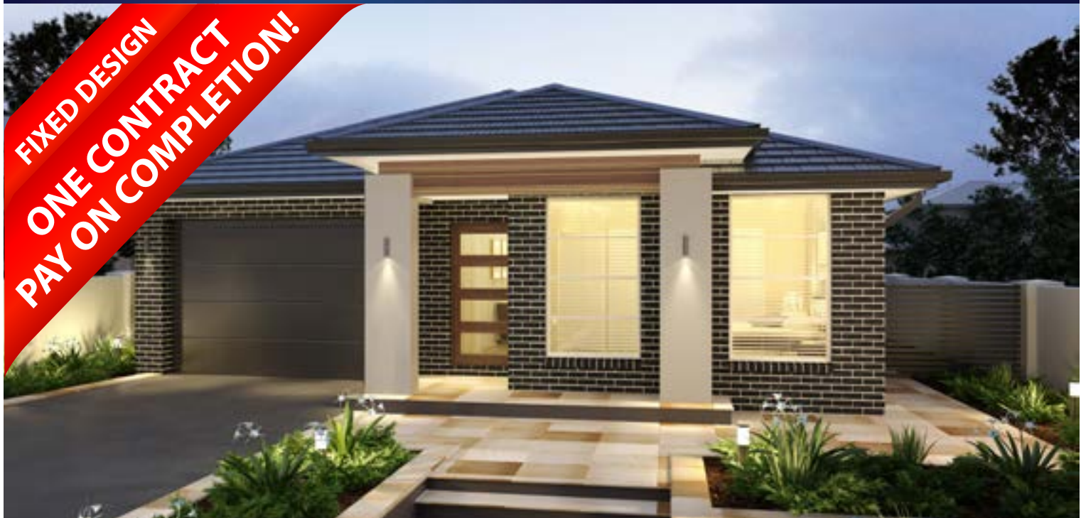
ARTIST IMPRESSION ONLY. GLEBE FAÇADE AS ILLUSTRATED.

FIXED DESIGN ONE CONTRACT PAY ON COMPLETION!