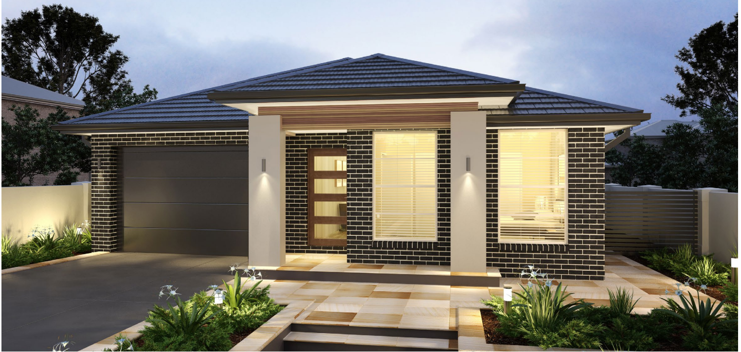
ARTIST IMPRESSION ONLY. GLEBE FAÇADE AS ILLUSTRATED.