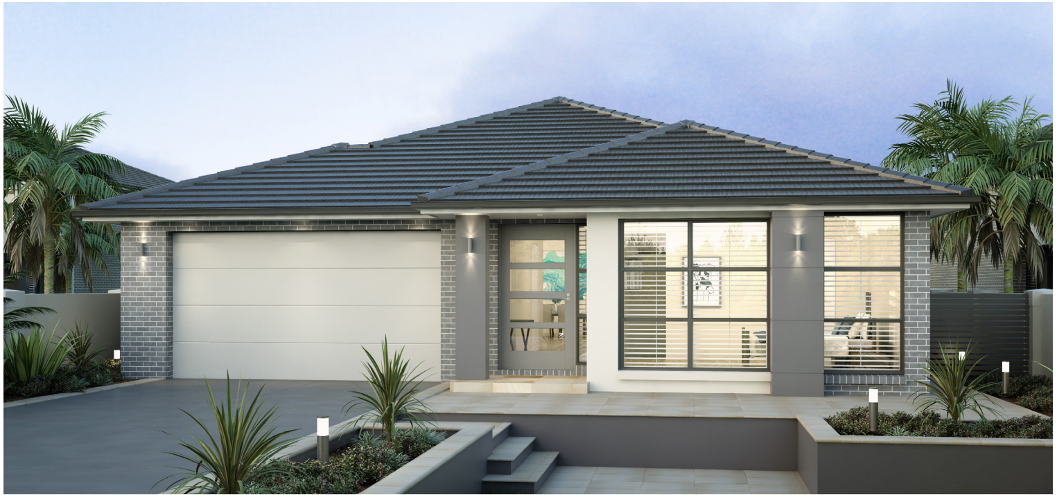
ARTIST IMPRESSION ONLY. BROOKLYN FAÇADE AS ILLUSTRATED.