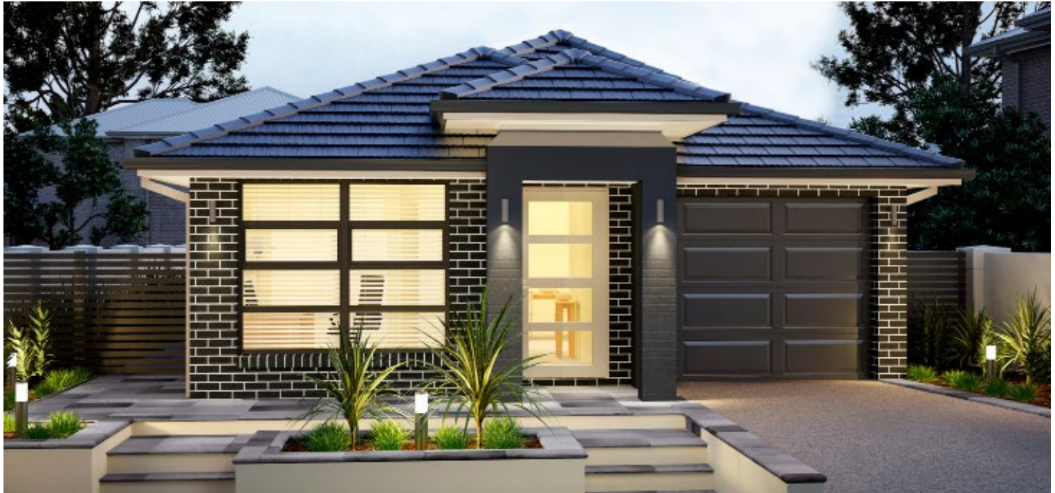
ARTIST IMPRESSION ONLY. ALTA FAÇADE AS ILLUSTRATED.