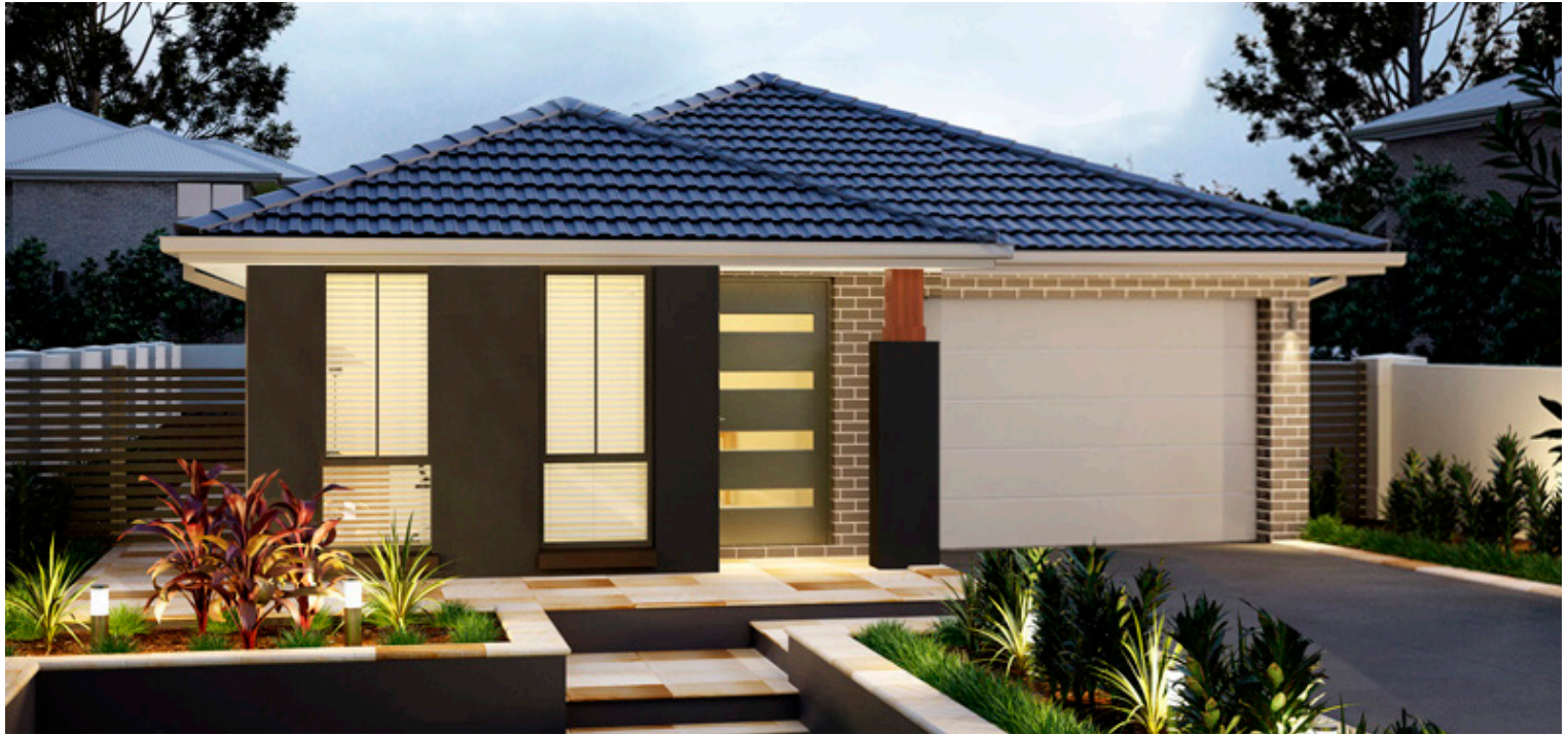
ARTIST IMPRESSION ONLY. CAPRI FAÇADE AS ILLUSTRATED.