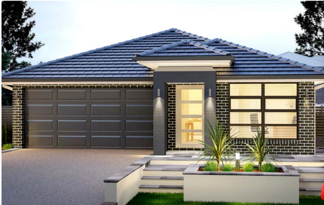
ARTIST IMPRESSION ONLY. ALTA FAÇADE AS ILLUSTRATED.