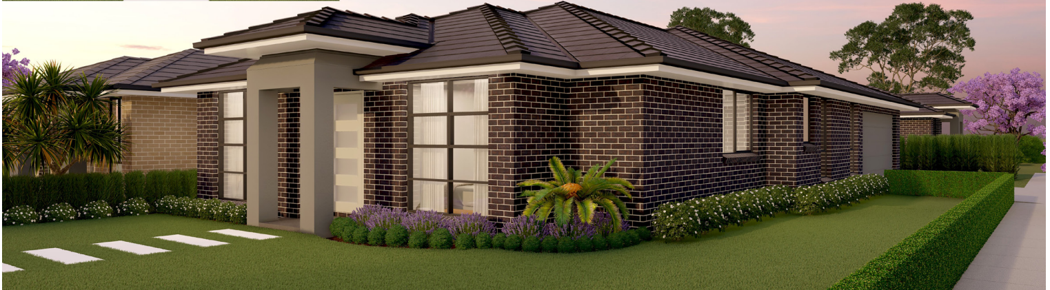
ARTIST IMPRESSION ONLY. ALTA CNR FAÇADE AS ILLUSTRATED.