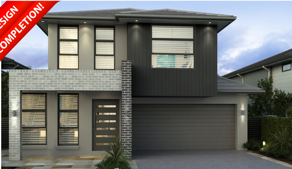
ARTIST IMPRESSION ONLY. OXLEY BRICK (MOD TO SUIT) FACADE AS ILLUSTRATED.