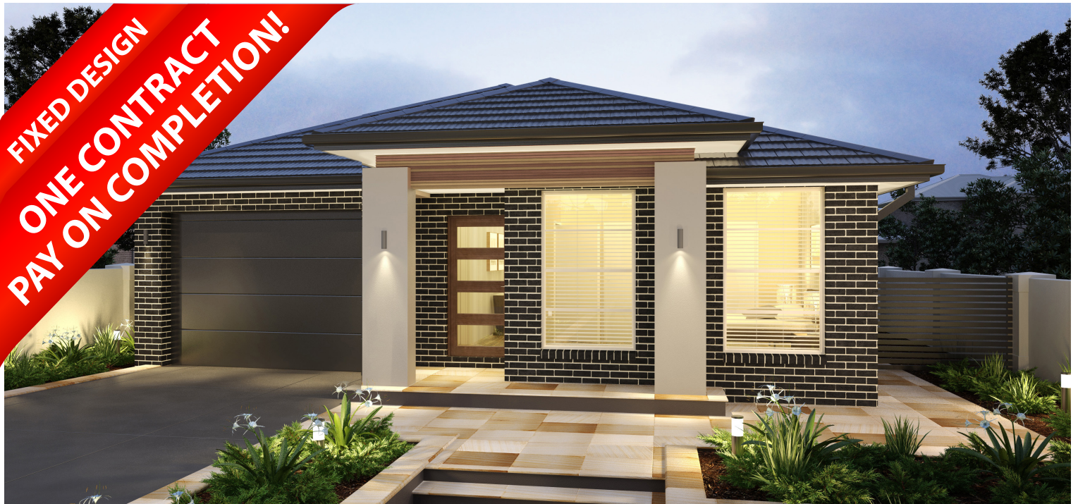
ARTIST IMPRESSION ONLY GLEBE FACADE AS ILLUSTRATED.

FIXED DESIGN ONE CONTRACT PAY ON COMPLETION!