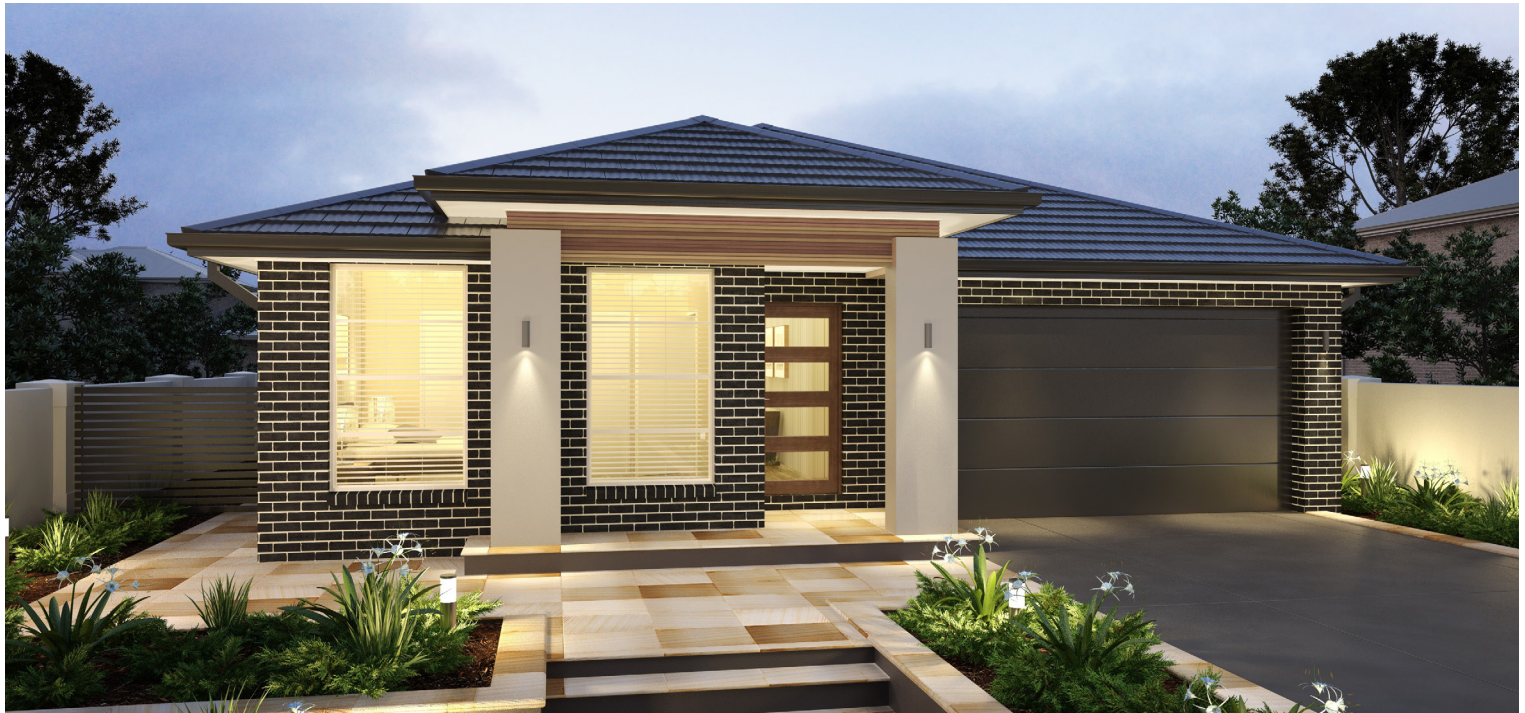
ARTIST IMPRESSION ONLY. GLEBE FAÇADE AS ILLUSTRATED.