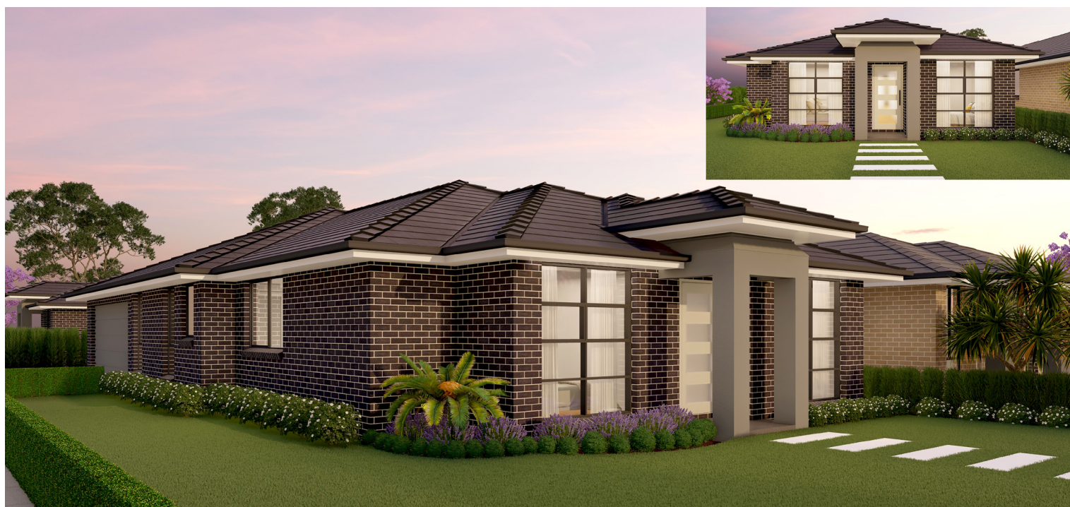
ARTIST IMPRESSION ONLY. ALTA SIDE FAÇADE AS ILLUSTRATED.