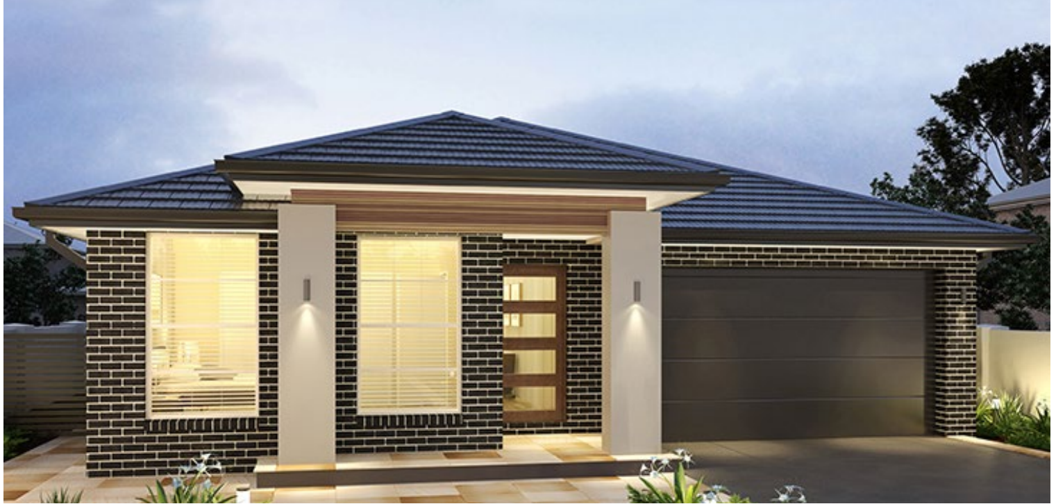
ARTIST IMPRESSION ONLY. GLEBE FAÇADE AS ILLUSTRATED.