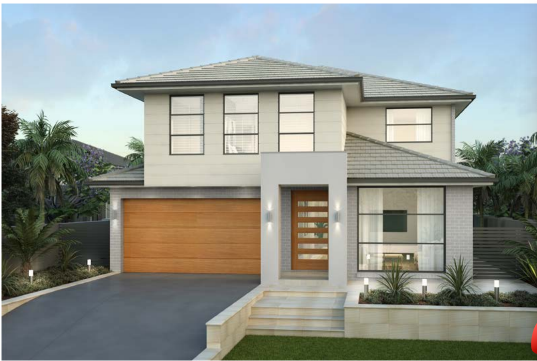
ARTIST IMPRESSION ONLY. DENTON FAÇADE AS ILLUSTRATED.