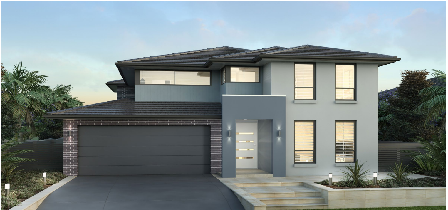
ARTIST IMPRESSION ONLY. CALANDRA FAÇADE AS ILLUSTRATED.