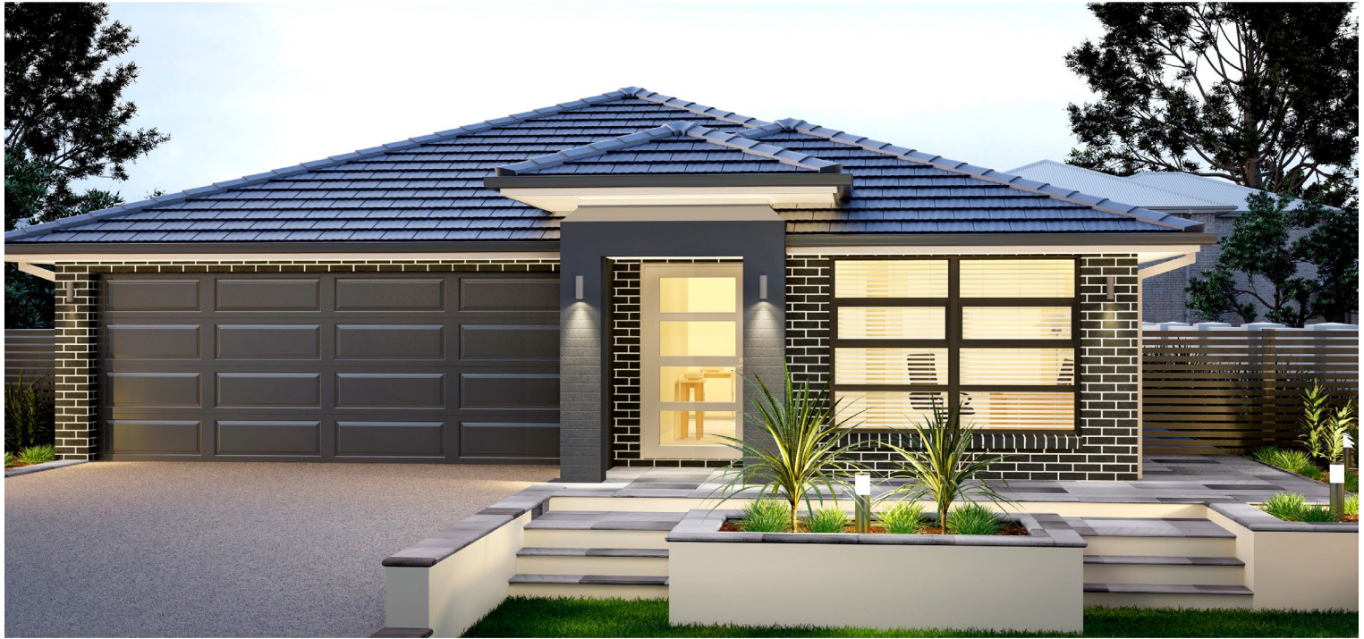
ARTIST IMPRESSION ONLY. ALTA FAÇADE AS ILLUSTRATED.