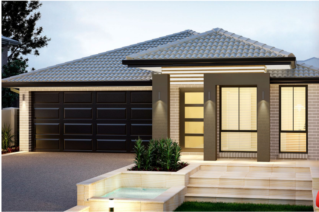
ARTIST IMPRESSION ONLY. STRATTON FAÇADE AS ILLUSTRATED.