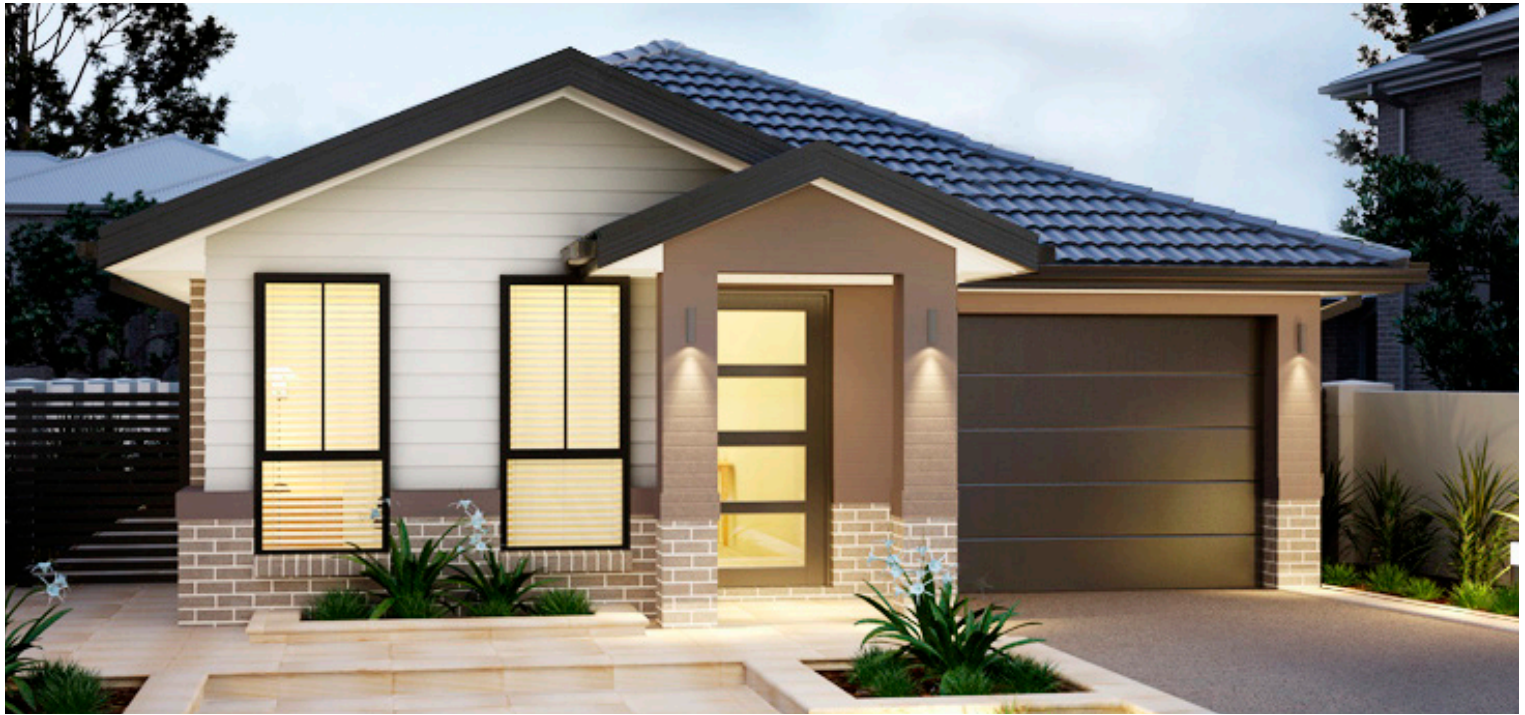
ARTIST IMPRESSION ONLY. TRADITIONAL FAÇADE AS ILLUSTRATED.