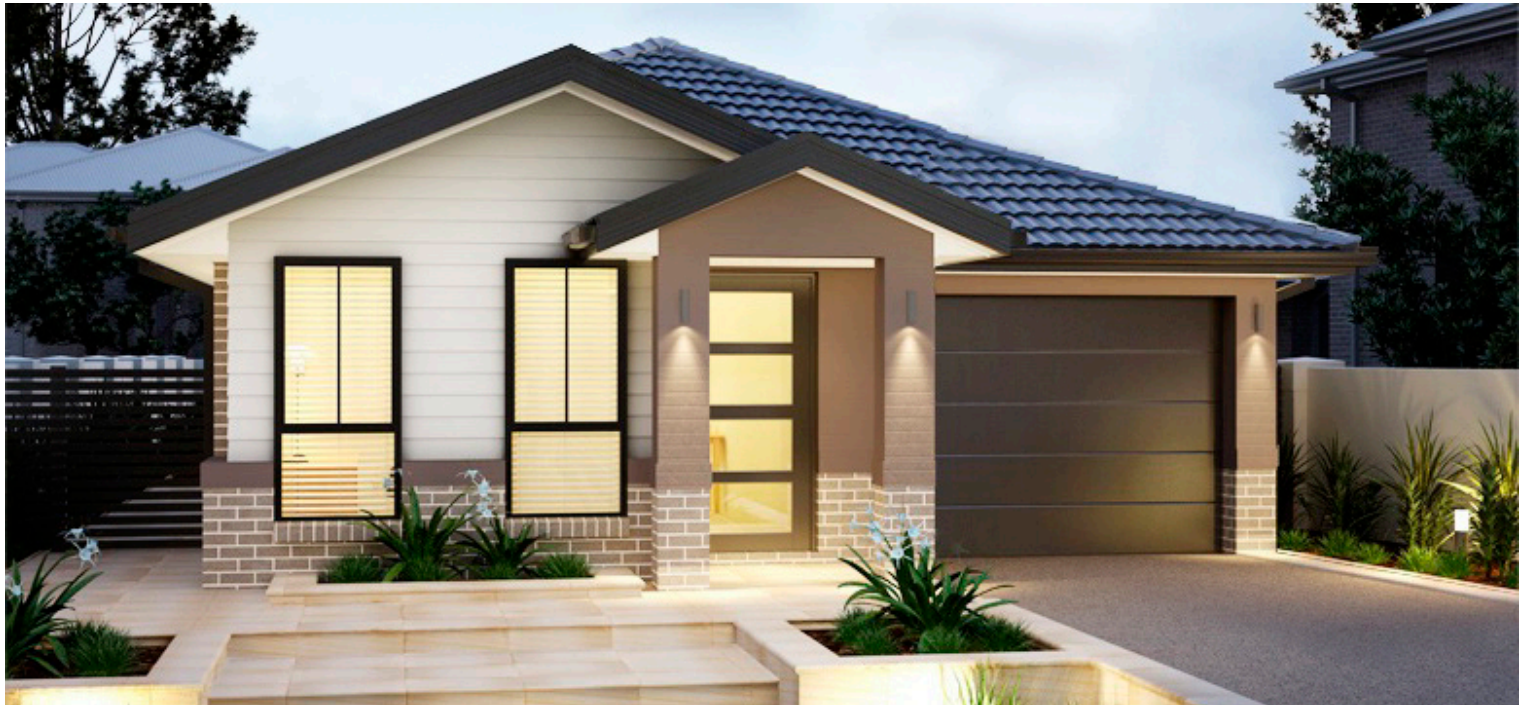
ARTIST IMPRESSION ONLY. NEW TRADITIONAL FAÇADE AS ILLUSTRATED.