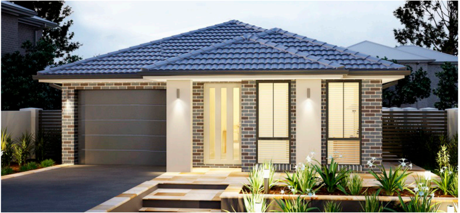
ARTIST IMPRESSION ONLY. ASPEN FAÇADE AS ILLUSTRATED.