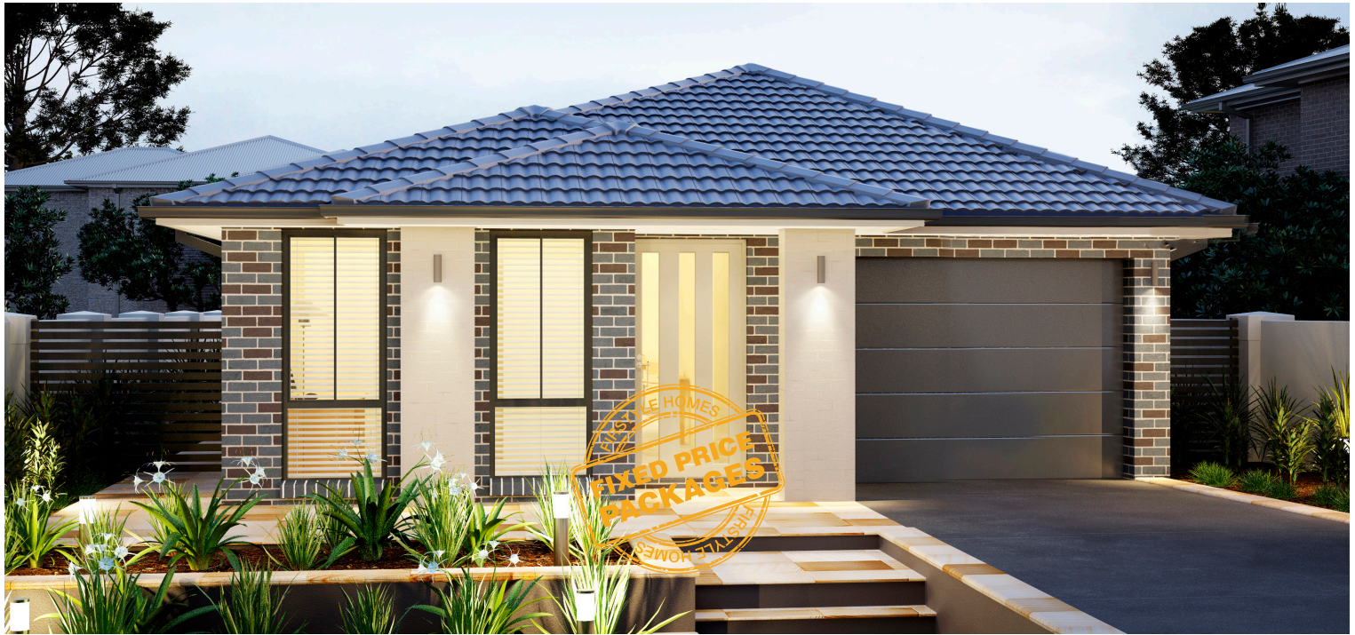
ARTIST IMPRESSION ONLY. ASPEN FAÇADE AS ILLUSTRATED.