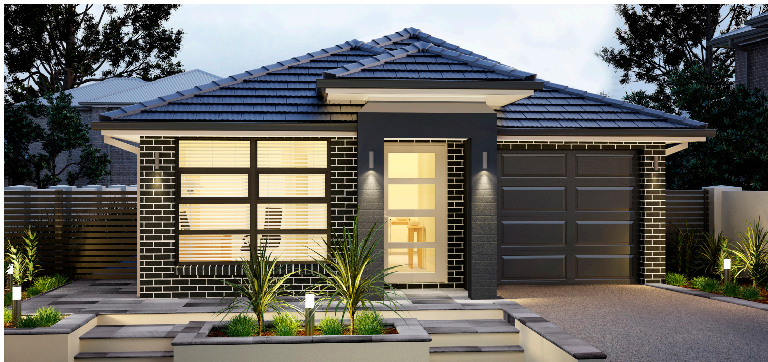
ARTIST IMPRESSION ONLY. ALTA FAÇADE AS ILLUSTRATED.