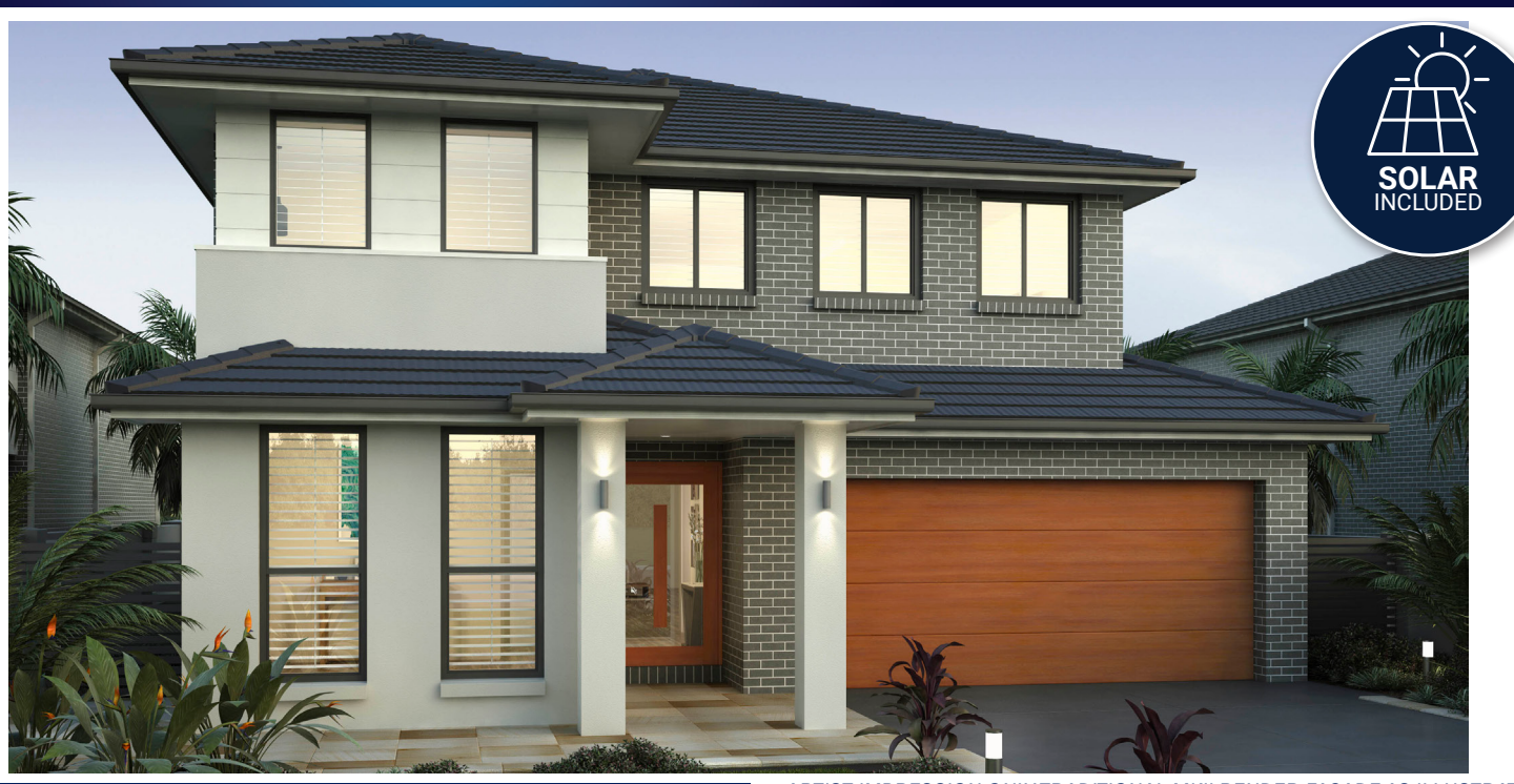
ARTIST IMPRESSION ONLY.TRADITIONAL MKII RENDER FAÇADE AS ILLUSTRATED.