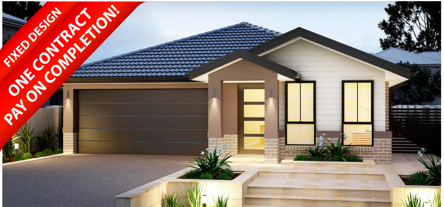
ARTIST IMPRESSION ONLY. NEW TRADITIONAL FACADE AS ILLUSTRATED.

FIXED DESIGN ONE CONTRACT PAY ON COMPLETION!