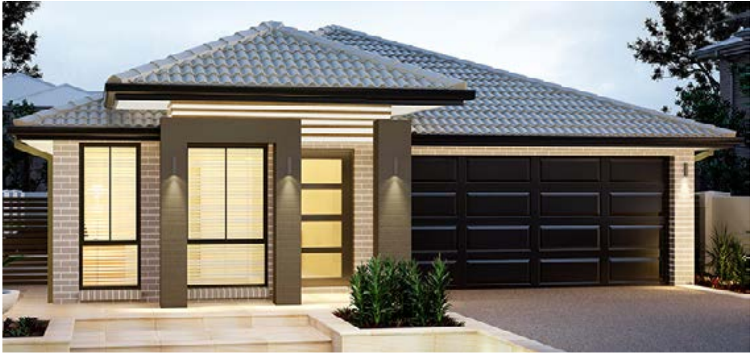
ARTIST IMPRESSION ONLY. STRATTON FAÇADE AS ILLUSTRATED.