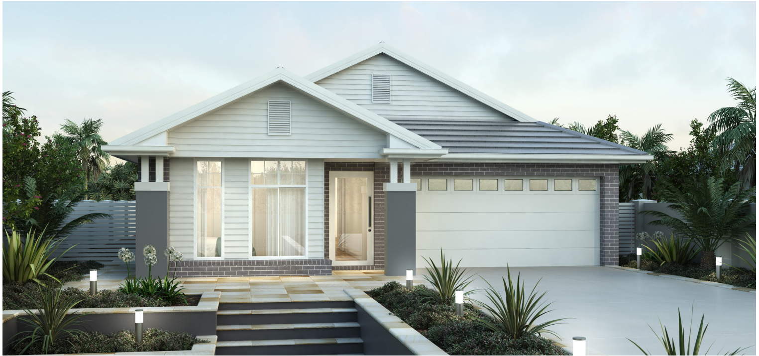
ARTIST IMPRESSION ONLY. BALLINA FAÇADE AS ILLUSTRATED.