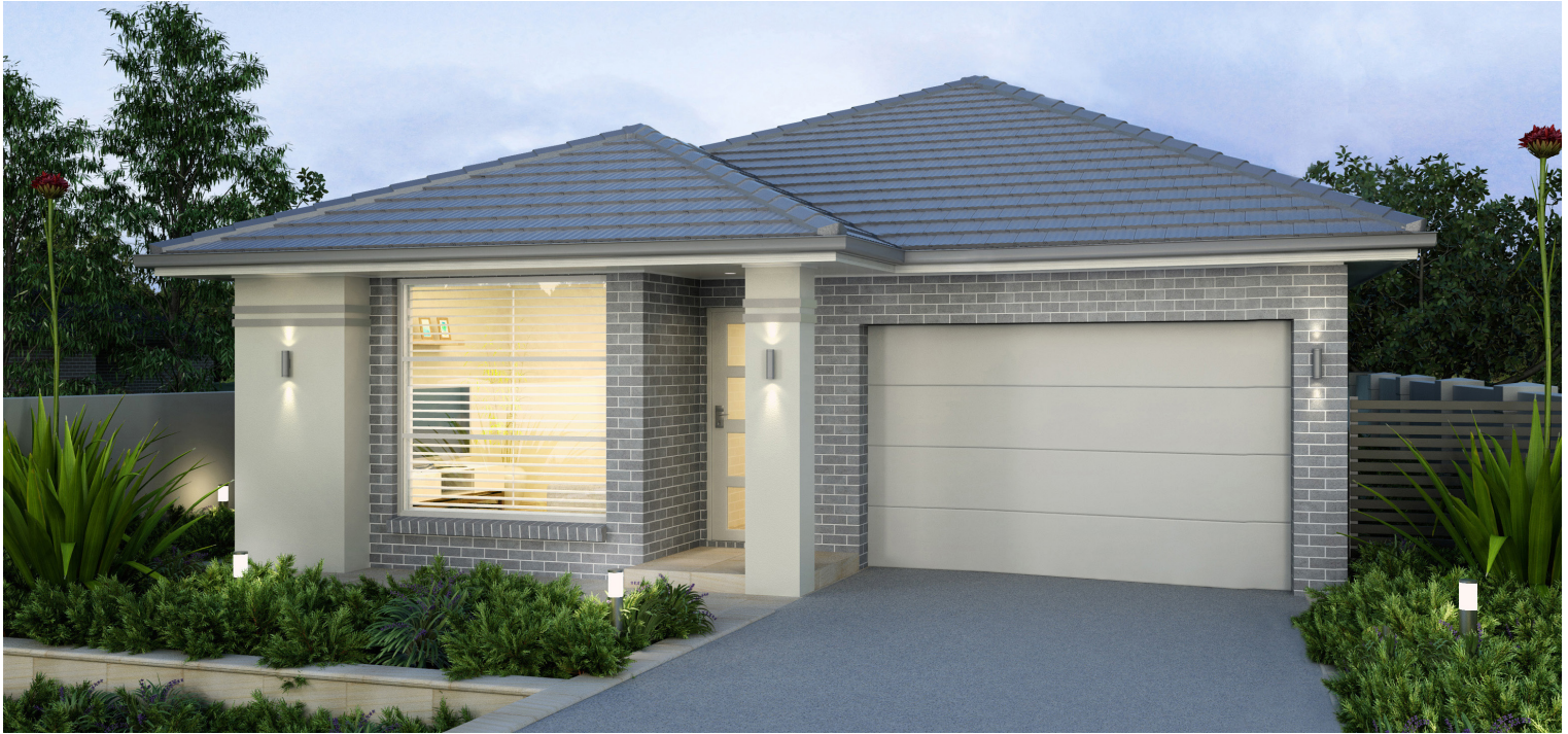
ARTIST IMPRESSION ONLY. SORRELL FAÇADE AS ILLUSTRATED.