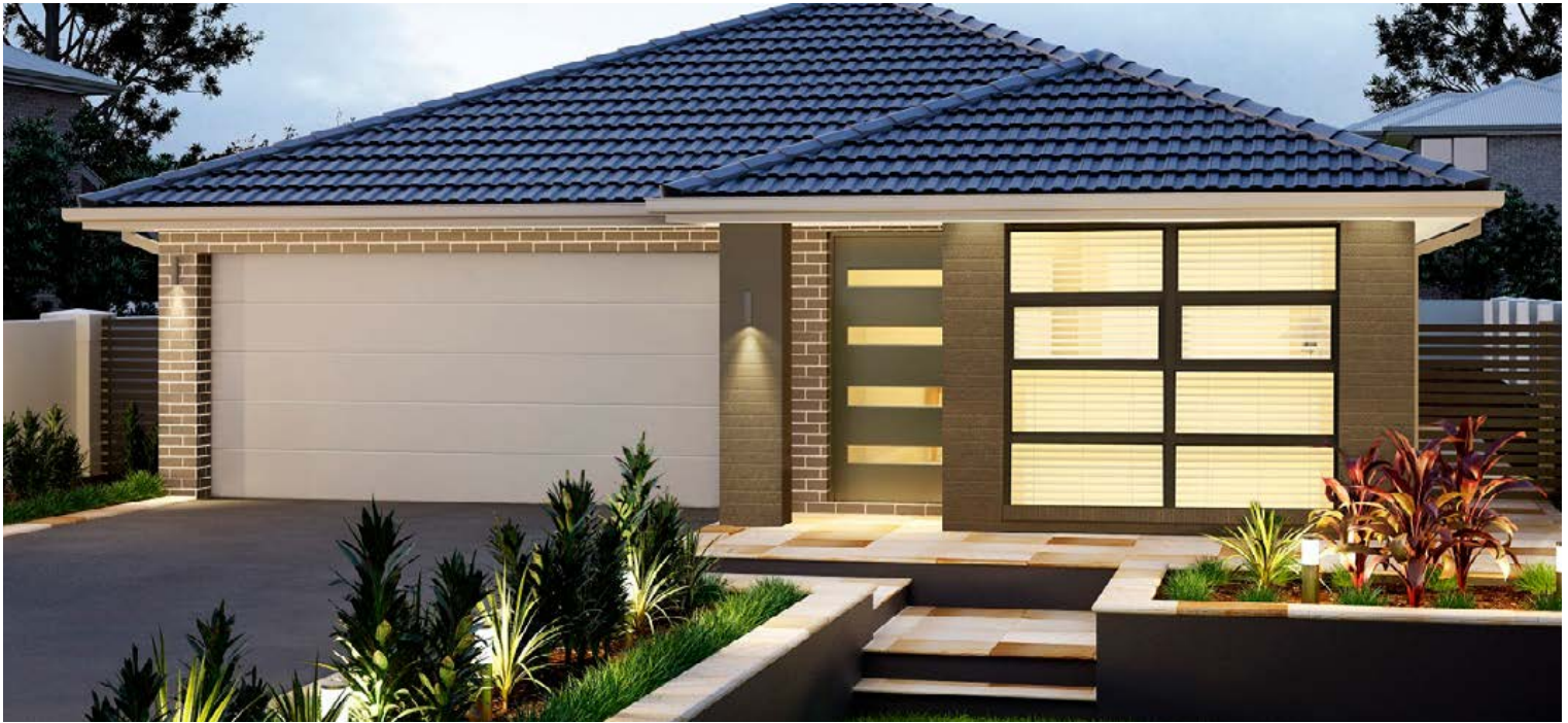
ARTIST IMPRESSION ONLY. DUNE FAÇADE AS ILLUSTRATED.