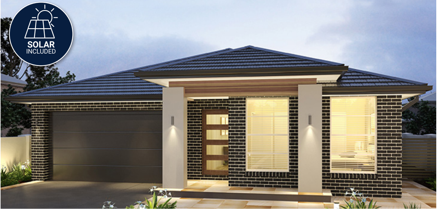
ARTIST IMPRESSION ONLY. GLEBE FAÇADE AS ILLUSTRATED.