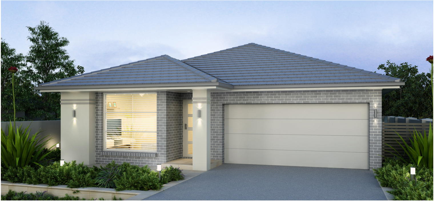
ARTIST IMPRESSION ONLY. SORELL FAÇADE AS ILLUSTRATED.