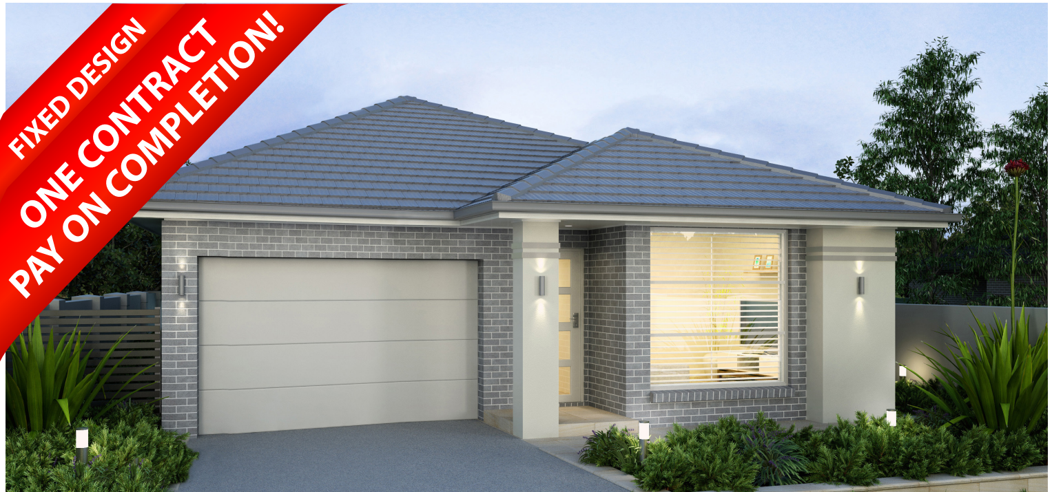
ARTIST IMPRESSION ONLY. SORELL FACADE AS ILLUSTRATED.

FIXED DESIGN ONE CONTRACT PAY ON COMPLETION!