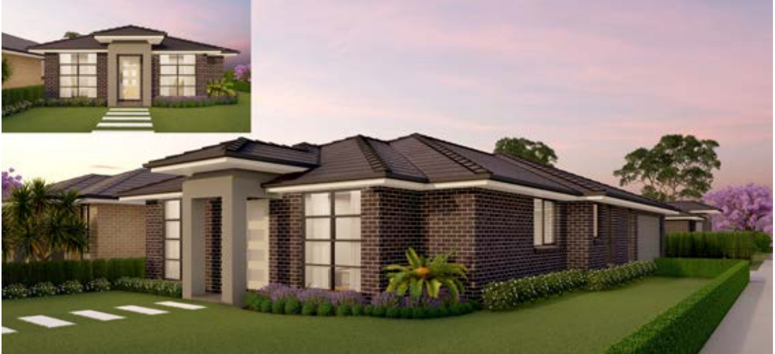
ARTIST IMPRESSION ONLY. ALTA CNR FAÇADE AS ILLUSTRATED.