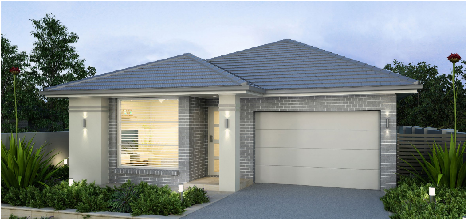
ARTIST IMPRESSION ONLY. SORELL FAÇADE AS ILLUSTRATED.