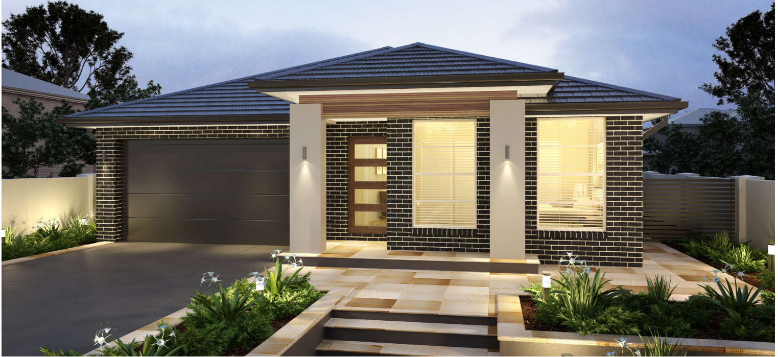
ARTIST IMPRESSION ONLY. GLEBE FAÇADE AS ILLUSTRATED.