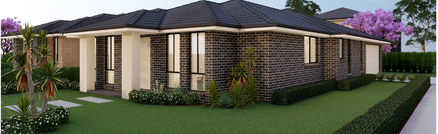
ARTIST IMPRESSION ONLY. ASPEN CNR FAÇADE AS ILLUSTRATED.