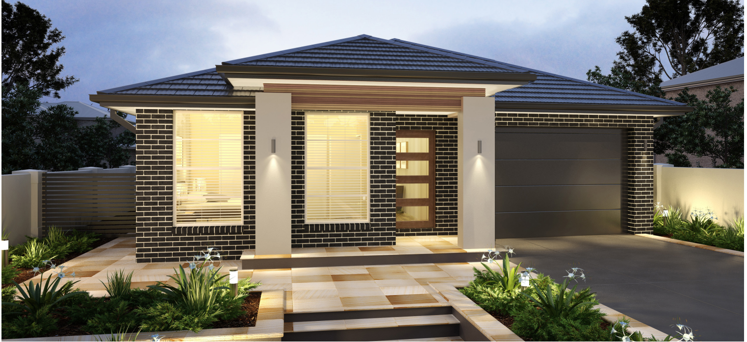
ARTIST IMPRESSION ONLY. GLEBE FAÇADE AS ILLUSTRATED.