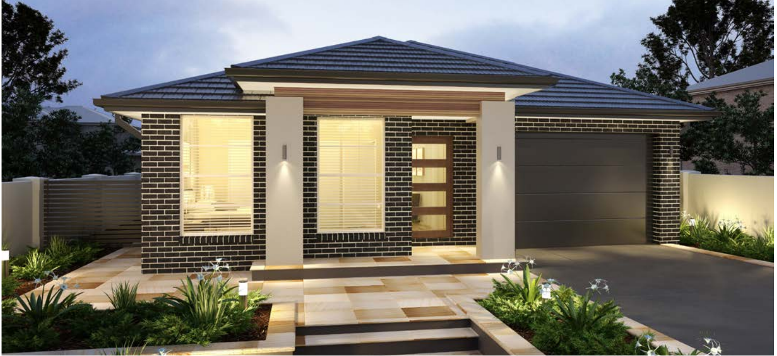
ARTIST IMPRESSION ONLY. GLEBE FAÇADE AS ILLUSTRATED.