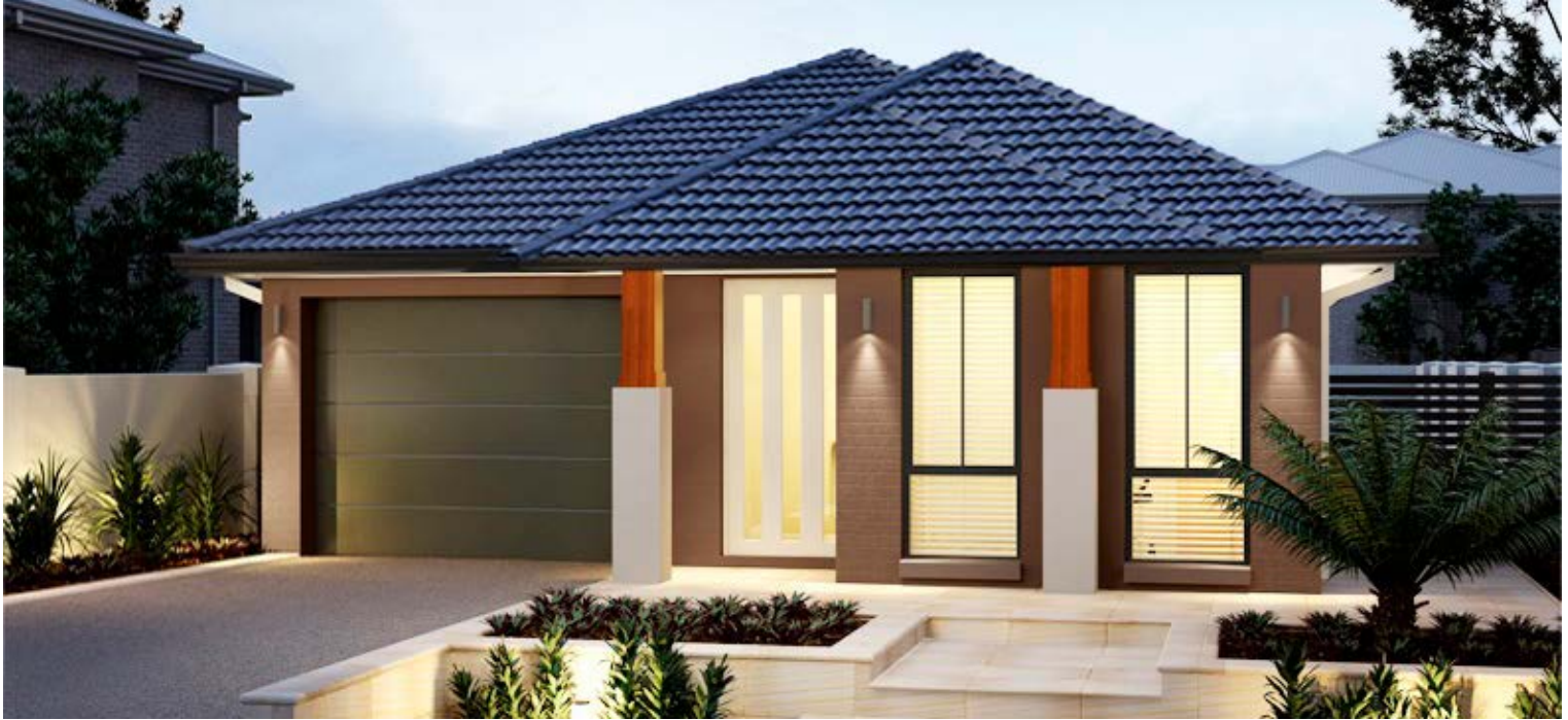
ARTIST IMPRESSION ONLY. TEMORA FAÇADE AS ILLUSTRATED.